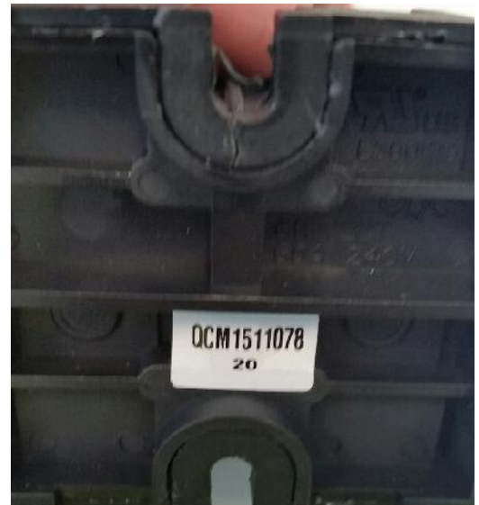
Figure 2 Bottom of disconnect housing showing the date code of the disconnect

Technical Services Department • 1810 Wilson Parkway • Fayetteville, TN 37334 Main: 888.593.9988 • Service Fax: 713.316.5541