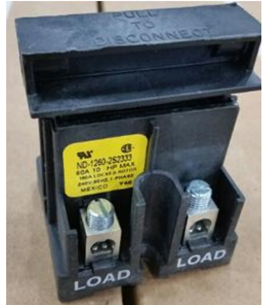
Figure 1 Disconnect with yellow label